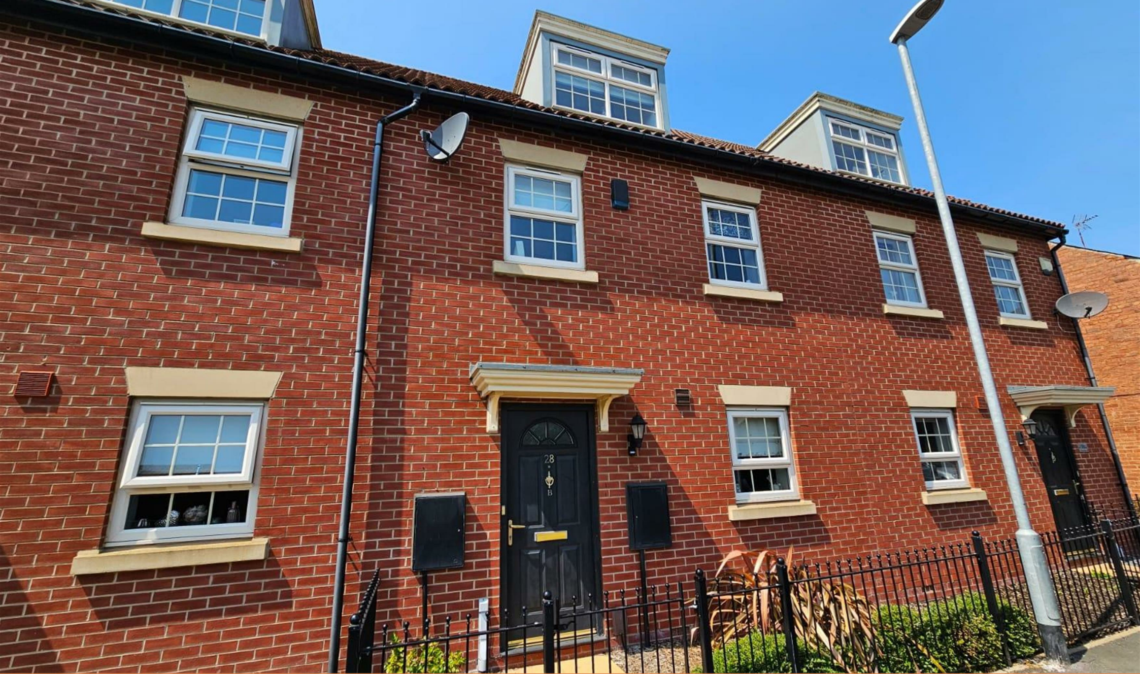
The Twitchell, Sutton-In-Ashfield, NG17 5DA